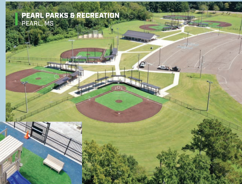
PEARL PARKS & RECREATION PEARL, MS