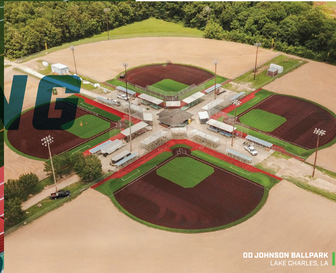
OD JOHNSON BALLPARK LAKE CHARLES, LA