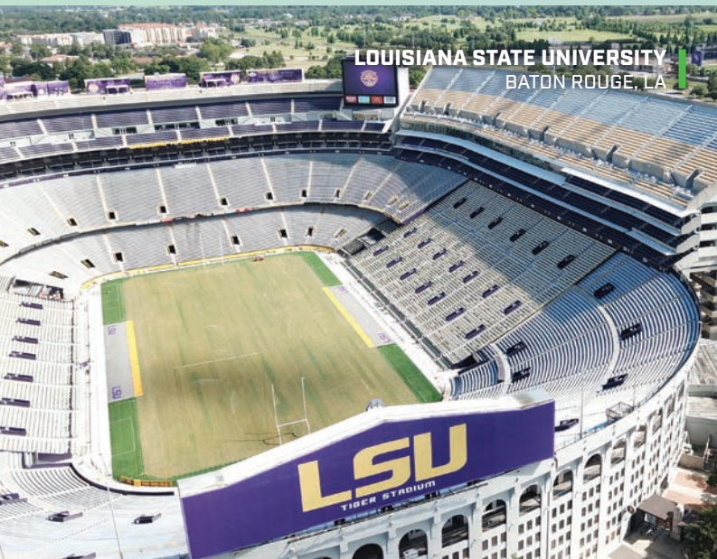
LOUISIANA STATE UNIVERSITY BATON ROUGE, LA

Atlanta Falcons Indoor Training Field Flowery Branch, GA