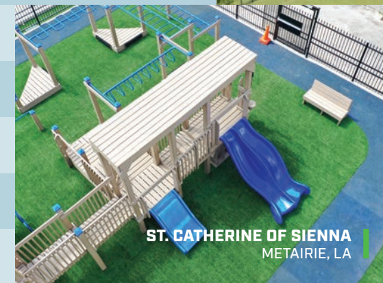
ST. CATHERINE OF SIENNA METAIRIE, LA