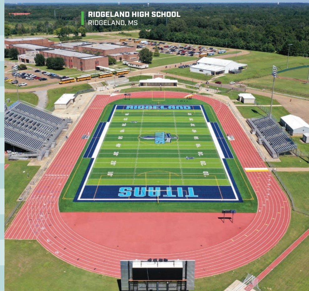
RIDGELAND HIGH SCHOOL RIDGELAND, MS