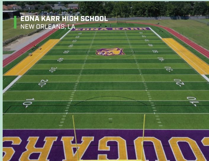
EDNA KARR HIGH SCHOOL NEW ORLEANS, LA

From professional training facilities and major universities to high schools and sports complexes, T3 Global features a long line of successful projects across the Gulf South, Caribbean and Central America.